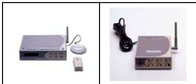
AM6000 & Remote