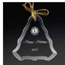
3 ¾" H x 3 ⅝" W $11.50 each

You may also purchase ornaments online from LCI at https://www2.lionsclubs.org/ .