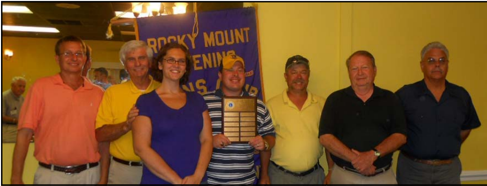
The Rocky Mount Evening Lions Club hosted the Jungle Prowler Award night recently. Clubs in attendance were the Tarboro, Rocky Mount Luncheon, Saratoga, and Scotland Neck Lions Clubs. The Scotland Neck Lions Club took home the trophy with 75 points. Shown above are members of the Scotland Neck club with the Jungle Prowler Award.