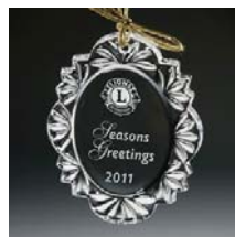
3 ½" H x 2 ¾" W $18.50 each

To place your order, visit the Lions Shop online or call 1-800-710-7822 or (630) 571-5466. LCI will not accept orders after November 9. Delivery is approximately three weeks after November 9.